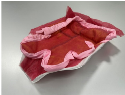
Laparoscopic Right Hemicolectomy Surgery Simulator "COLOMASTER"

Training for surgeons typically involves the use of animals, cadavers, and simulators. However, the use of animals or cadavers presents ethical and cost barriers, and it is difficult to ensure adequate environmental conditions. Furthermore, there was no simulator available for training surgeons to perform all stages of surgery using the forceps and devices commonly used in actual surgeries. Therefore, our company collaborated with the Department of Colorectal Surgery at the National Cancer Center Hospital East to develop an anatomically accurate simulator capable of reproducing the entire surgery from start to finish (location: NEXT Medical Device Development Center). With this simulator, surgeons can acquire skills such as understanding anatomical structures, expanding their field of view, and mastering dissection techniques, which are crucial during surgery. This enables the realization of high-quality, cost-effective training environments anywhere in the world, further contributing to the improvement of surgical skills.